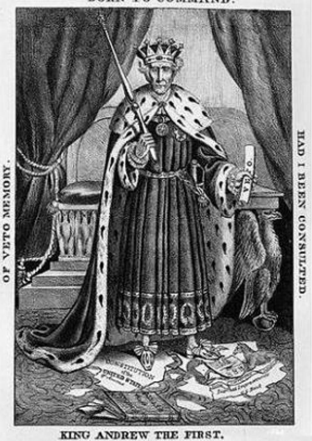
Political Cartoon III: King Andrew (Library of Congress, 1832) BORN TO COMMAND.