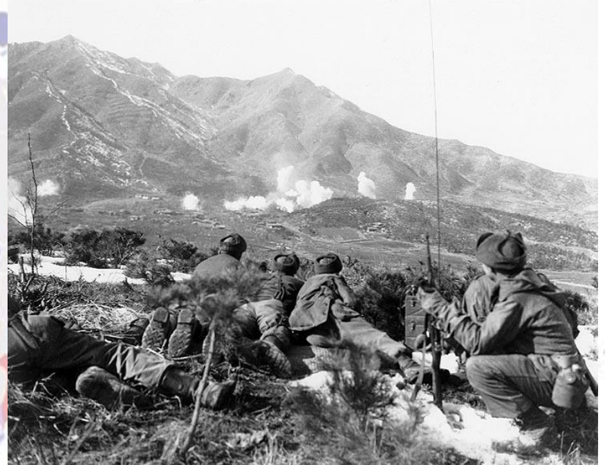
Photo # SC 357227 Troops watch bombardment of enemy-held area in Korea, Feb. 1951