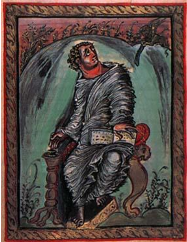
St. Mark from the Ebbo Gospels, folio 18v., c. 816-35

This development is evident in tracing author portraits in illuminated manuscripts. The Godescalc Gospel Lectionary , commissioned by Charlemagne and his wife Hildegard, was made circa 781-83 during his reign as King of the Franks and before the beginning of the Carolingian Renaissance. In the portrait of St. Mark, the artist employs typical Early Byzantine artistic conventions. The face is heavily modeled in brown, the drapery folds fall in stylized patterns and there is little or no shading. The seated position of the evangelist would be difficult to reproduce in real life, as there are spatial inconsistencies. The left leg is shown in profile and the other leg is shown straight on. This author portrait is typical of its time.