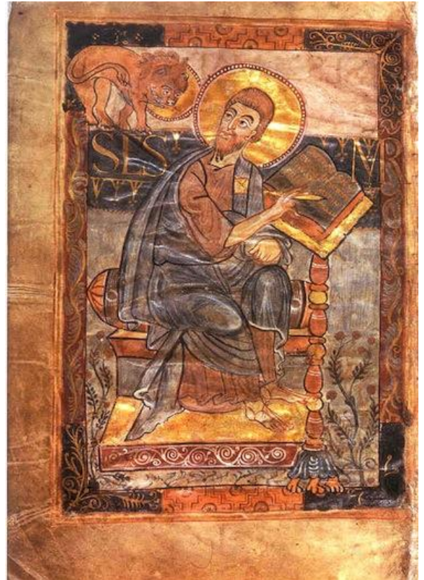
St. Mark from the Godescalc Gospel Lectionary, folio 1v., c. 781-83

The Ebbo Gospels were made c. 816-35 in the Benedictine Abbey of Hautvillers for Ebbo, Archbishop of Rheims. The author portrait of St. Mark is characteristic of Carolingian art and the Carolingian Renaissance. The artist used distinctive frenzied lines to create the illusion of the evangelist's body shape and position. The footstool sits at an awkward unrealistic angle, but there are numerous attempts by the artist to show the body as a three-dimensional object in space. The right leg is tucked under the chair and the artist tries to show his viewer, through the use of curved lines and shading, that the leg has form. There is shading and consistency of perspective. The evangelist sitting on the chair strikes a believable pose.