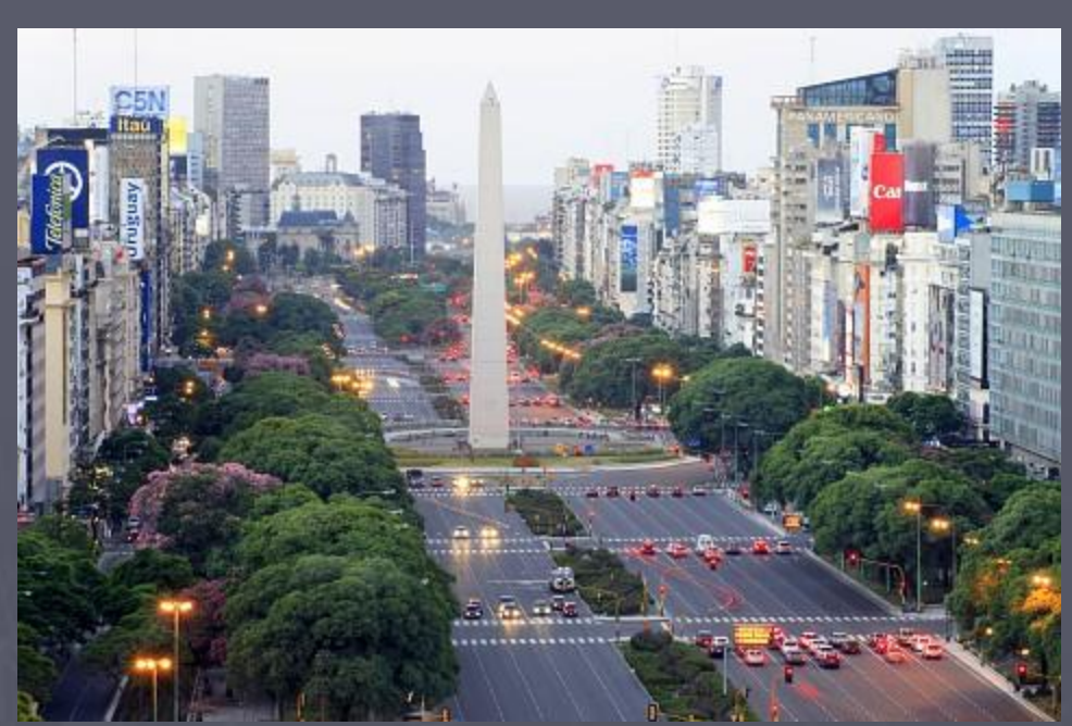
Central Business District