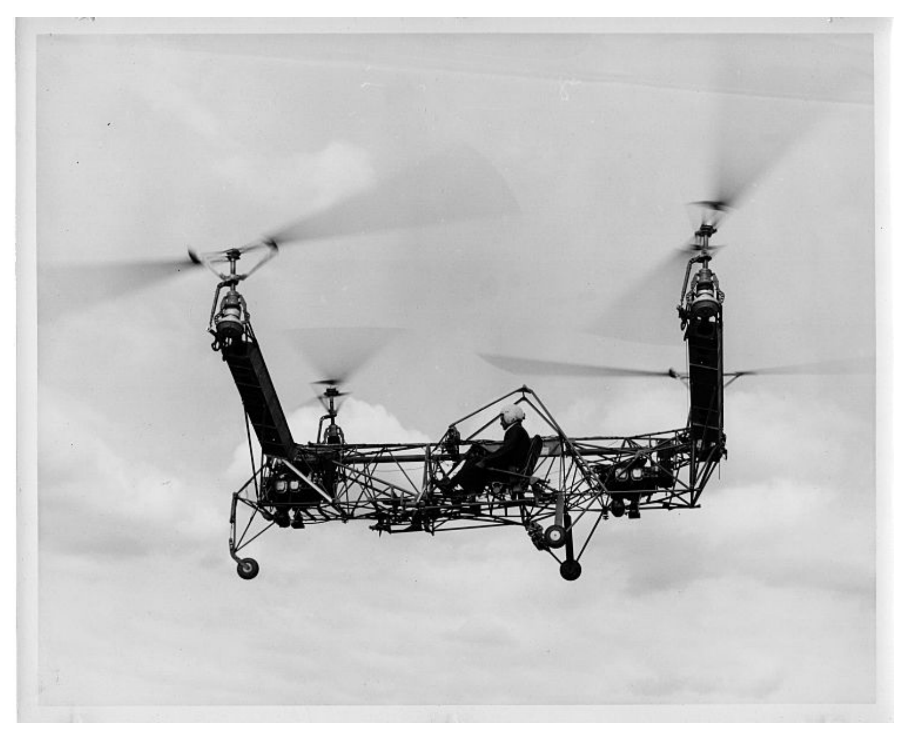
Convertawings quadrotor, Long Island March 1956.